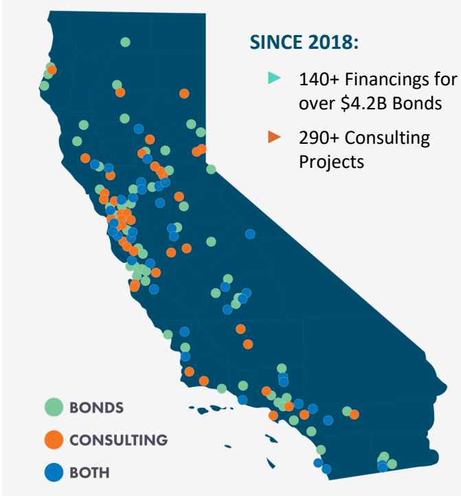
*Dots represent client engagements since 2000